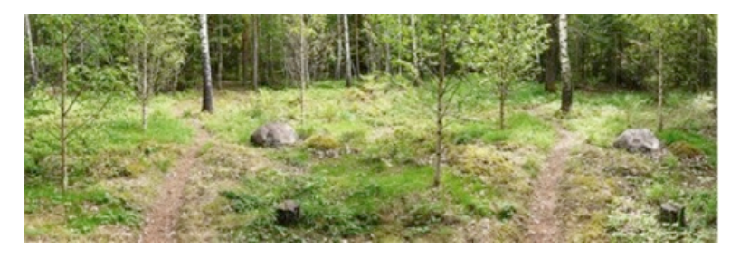
Maria Lilja, "Twinroad", nature installation 2013

In a time when our freedom can be perceived as increasingly limited, we often hear that the options are endless. But if all options are alike or if we are unable to grasp the consequences of our choices, what freedom do we really possess? In Maria Lilja's works, we face inherent contradictions. What looks like simple choices at first, is made complex and transformed into something that are likely to create confusion as opposed to clarity.